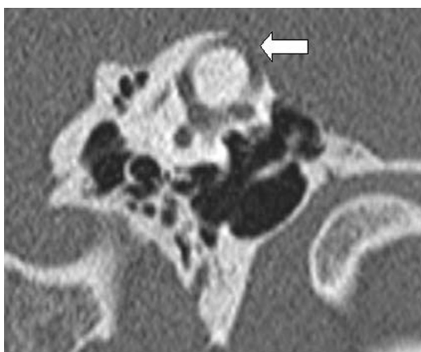
Figure 2 High-resolution CT scan showing a left superior semicircular canal dehiscence (arrow).

Acoustic reflexes and vestibular evoked myogenic potentials (VEMPs) aid in the identification of patients with an apparent conductive hearing loss with normal acoustic reflexes or those patients who are found to have an asymptomatic dehiscence on radiology [4]. The treatment involves avoidance of the precipitating stimuli [5].