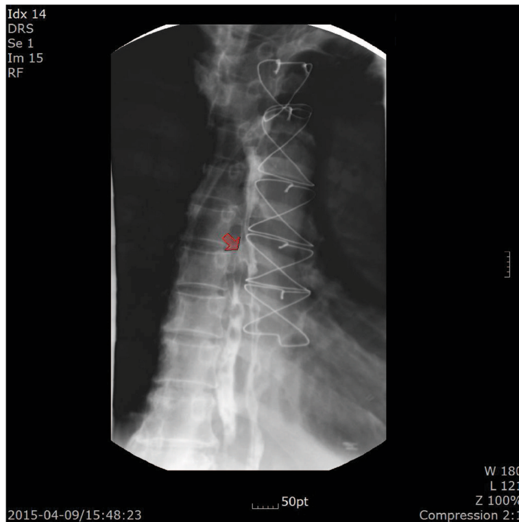
Fig. 2 Esophagography. A contrast leakage in the right wall of the middle esophagus is visible (arrow)