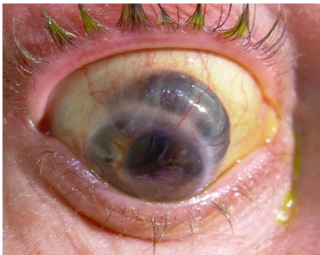
Figure 3 Colour photograph of the right eye showing the extensive thinning of the superior sclera and secondary anterior staphyloma formation.

tion of bilateral anterior uveitis with possible exposure to group A streptococci.