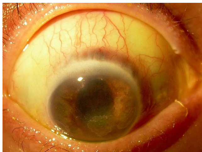
Figure 2 Colour photograph of the right eye indicating the initial thinning of the sclera at the superior limbus.