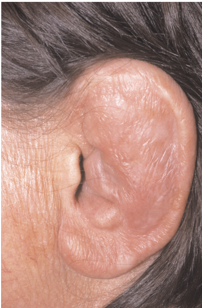
Figure 3. A photograph of the pinna showing auricular chondritis, with the earlobe spared of any inflammation.