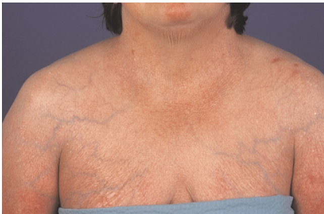
Figure 2. A photograph showing generalized cutaneous inflammation.