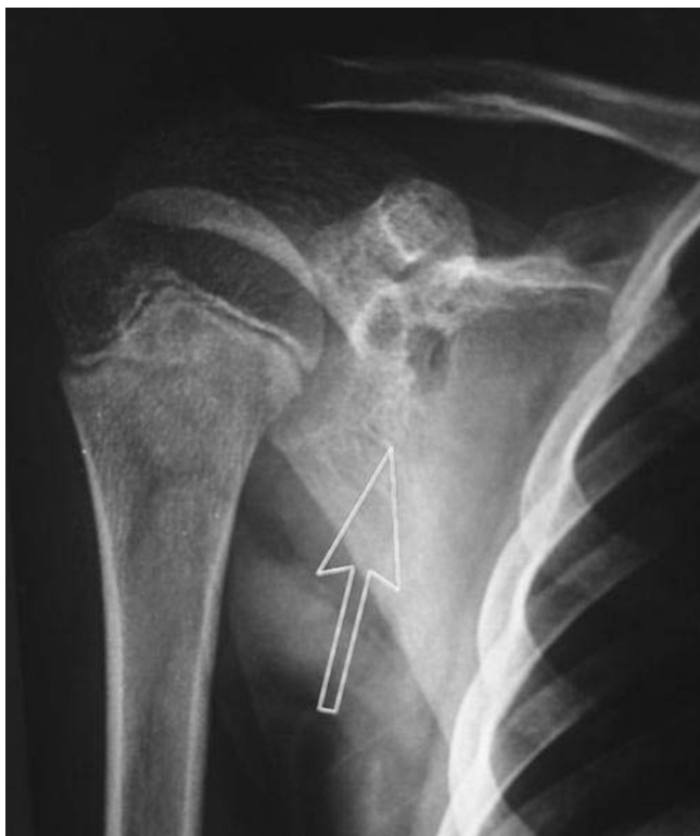
Figure 1. Anteroposterior (AP) radiograph of the shoulder showing two well defined lytic destructive lesions involving the glenoid margin suggestive of cystic tuberculosis.

of tubercular osteomyelitis and only six were isolated to the scapula [5-9,12]. We report tuberculosis of the scapula in a 14-year-old male patient. Previously, Greenhow and Weintrub [10] also reported tubercular involvement of the scapula in a pediatric patient. Clinically, patients with