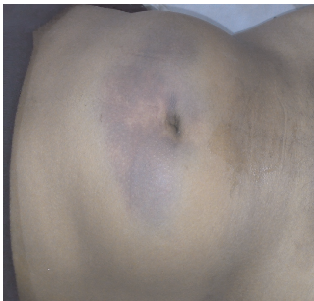
Figure 1. Parietal swelling with bruising after motor vehicle accident.

without complications and was discharged on the 6th day. He was asymptomatic, 1 month after the operation.