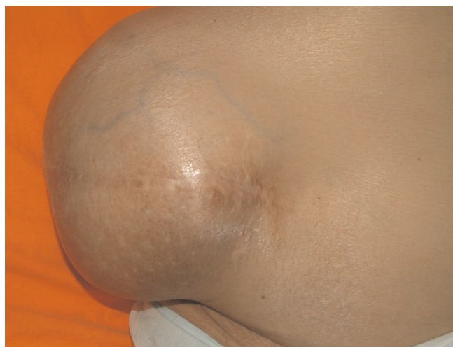
Figure 1. Photograph showing the patient with an incisional hernia.

Plain abdominal radiography taken in the upright position demonstrated no air-fluid levels, suggesting small bowel obstruction. Abdominal ultrasonography showed parenchymal inhomogeneity of the liver with irregular margins, splenomegaly (with a craniocaudal diameter of 157 mm), a large splenic vein, and a hernial sac sized 21 × 13 × 9.5 cm located in the right lumbar region. Magnetic resonance imaging revealed a 6.5 cm fascial defect and mesenteric fatty tissue and bowel as the content of the hernial sac but with no sign of incarceration