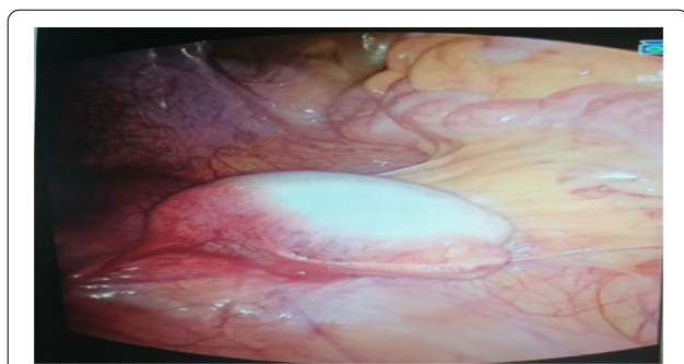
Fig. 1. Surgical specimen

The testes were found inside the abdominal cavity. They were subsequently dissected and removed (Fig. 1). Histopathology revealed two testes with atrophic seminiferous tubules containing only Sertoli cells, associated with Leydig cell hyperplasia (Fig. 2). No signs of malignancy were identified. Genital reconstruction was not done because the patient had normal-appearing female external genitals, and she was started on estradiol oral replacement therapy to prevent the regression of secondary