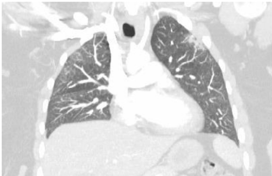
Fig. 1 Initial CTA suggesting pneumonia and ground-glass opacities

Significant laboratory values included brain natriuretic peptide of 7890 pg/ml. The patient's EKG again showed sinus tachycardia without any obvious ST elevation or depression, no electrical alternans, and normal voltage. A respiratory polymerase chain reaction viral panel result was negative for all pathogens tested.