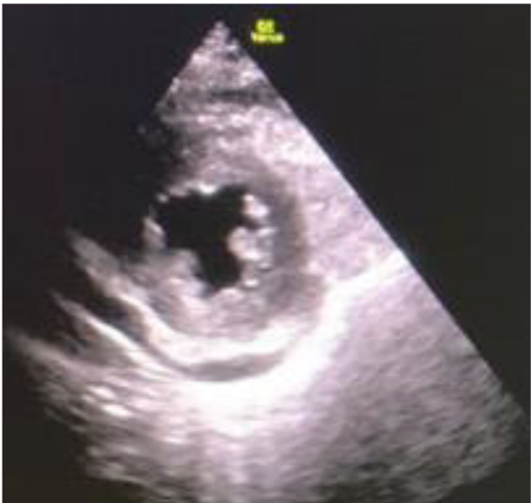
Fig. 4 US showing pericardial effusion