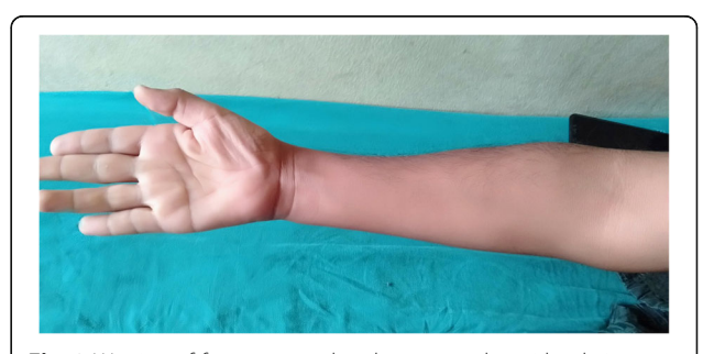
Fig. 2 Wasting of forearm muscles, thenar muscles with relative sparing of brachioradialis muscle

A complete blood count (hemoglobin, total leukocyte count, differential leukocyte count, and platelet count), blood urea, serum creatinine, serum electrolytes, liver function tests, thyroid function tests, erythrocyte sedimentation rate, C-reactive protein, creatine phosphokinase, viral serology markers (human immunodeficiency virus, hepatitis B and C virus, venereal disease research laboratory test), and a plain cervical spine X-ray were normal. Anti-nuclear antibodies, anti-double-stranded deoxyribonucleic acid (DNA) antibodies, and anti-neutrophil cytoplasmic antibodies were absent.