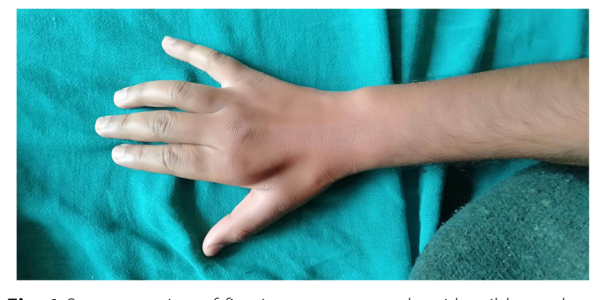
Fig. 1 Severe wasting of first interosseus muscle with mild atrophy of rest of the interossei muscles

space in the dorsum of his right hand (Fig. 1). Muscle power was assessed by the Medical Research Council scale where weakness was observed on the right side: interossi (2/5), elbow flexon and extension (4/5), wrist flexon and extension (3/5), thenar and hypothenar were atrophied, but the brachioradialis was spared (Fig. 2). The power of his left hand and forearm was normal. Tone was reduced around his right wrist and elbow. Minipolymyoclonus was present in the fingers of his bilateral upper limbs, less prominent on the left side. His deep tendon reflexes were bilaterally symmetrical and normal in his upper and lower limbs except the brisk reflex was noted in the right supinator. Sensation was intact and bilaterally symmetrical in his upper and lower limbs. The plantar reflex was normal; a bilaterally downward response and the Hoffman sign were absent in both upper limbs.