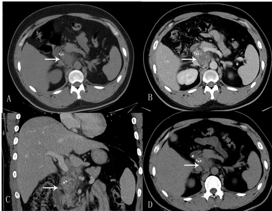
Fig. 1 a Computed tomography scan without contrast showing irregular soft tissue mass ( White arrow ). The lesion had an uneven interior and was surrounded by a blurred fat gap. There were multiple spots of high density with clear margins in the upper right of the lesion. b-c Contrast-enhanced computed tomography showing multilocular changes of the lesion ( White arrow ), uneven enhancement of cystic wall, slight enhancement of adjacent duodenal wall, and multiple enlarged lymph nodes. d Abdominal computed tomography was reviewed 1 month after treatment. Computed tomography scan without contrast showing the postoperative change of local high-density imaging in the duodenum wall, the volume of the lesion ( White arrow ) gradually decreased, and the edge was clear, and no substantial changes in the multiple high-density shadow spots were seen