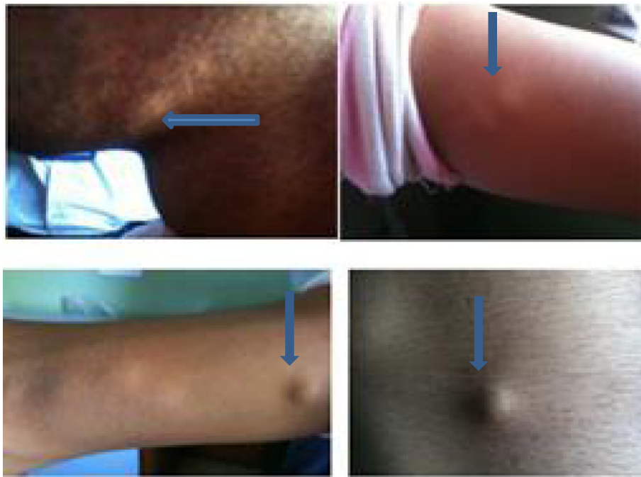
Fig. 1 Disseminated subcutaneous nodules as indicated by arrows on submandibular area, elbow, arm, and abdomen

his face, mandibular area, elbow, arm, and abdomen (Fig. 1).