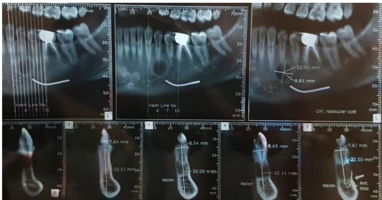
Fig. 6 A traumatic bone cyst at the apex of the first mandibular premolar, mimicking a radicular cyst

is widely accepted beyond the divergent views regarding the etiology of TBC, it does not agree with development of the lesion without a clear history of trauma to the orofacial region in many cases [27]. Moreover, the incidence of history of trauma in patients with TBC is not greater