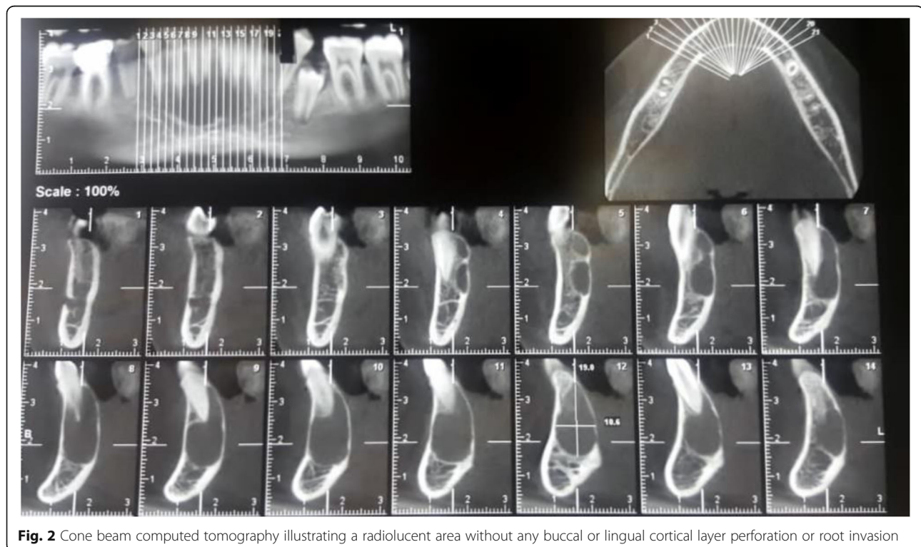
Fig. 2 Cone beam computed tomography illustrating a radiolucent area without any buccal or lingual cortical layer perforation or root invasion

A 14-year-old Persian patient was referred to a dentist with a complaint of mild and numb pain of the right side of her face. The patient reported a history of falling from height in her childhood and no history of a medical condition. The patient did not smoke or consume alcohol and was receiving no medications before the diagnosis of the lesion. Orthopantomography revealed an extensive, unilocular radiolucency that extended from the roots of the first mandibular premolar to the second molar of the right quadrant and the ramus with an overall length of 65 mm. CBCT revealed slight expansion and thinning of the buccal cortex and extension of the lesion beyond the roots. However, no root resorption or displacement was detected (Fig. 5). The teeth were proved to be vital on the basis of pulp vitality test results. The differential diagnoses were TBC and odontogenic keratocyst. A sulcal incision was performed from the right mandibular canine to the posterior region of the mandible. After providing a window approach from the distal aspect of the second molar, aspiration of the lesion was performed, which released bloody fluid. The window approach was then extended, and a blood-containing cavity without an epithelial lining determined the definitive diagnosis of TBC. The patient did not present any complaint during follow-up every 6 months.