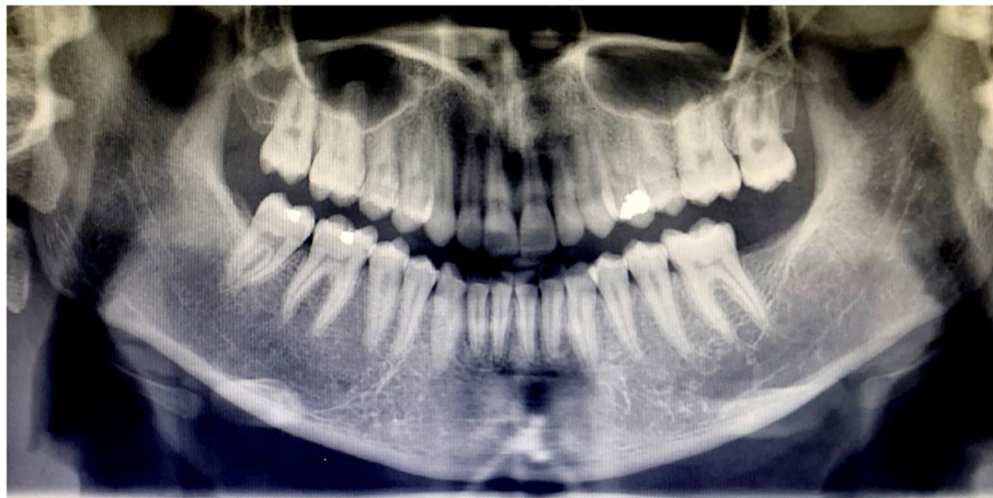
Fig. 4 Comparative remission of the cyst 6 months after surgery

We describe three different cases of TBC, representing varied characteristics of this lesion. TBC has been referred to by different names in the literature. When occurring in the jaw, traumatic, hemorrhagic, or extravasation bone