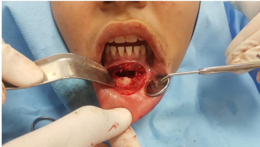
Fig. 3 The surgical approach to the lesion. Note the vacant cavity, which is characteristic of traumatic bone cyst