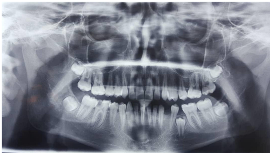
Fig. 1 Orthopantomograph revealing extension of the lesion from the distal aspect of the left mandibular canine to the mesial aspect of the right premolar

A 13-year-old Persian girl with no contributory medical history was referred to a dentist for orthodontic tooth movement. A radiolucent, well-defined lesion was observed by orthopantomography in the anterior mandibular region, which extended to the first premolar area of the right side of the mandible (Fig. 1). The patient did not report a medical condition and did not have smoke or consume alcohol. Moreover, she was receiving no medications before the diagnosis of the lesion. She was then referred to the craniomaxillofacial department of