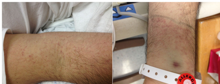
Fig. 1 Petechial skin rash

At initial assessment on admission the physical examination was remarkable for a blood pressure of 132 systolic and 77 diastolic mmHg, a temperature of 39.6 °C (103.2 °F), pulse of 132, and respiratory rate of 18. He was well developed, well groomed, with skin remarkable for non-confluent, non-blanching erythematous macules. He had an atraumatic head and his eyes had reactive pupils that were symmetric with clear conjunctiva. He had a supple neck with no signs of jugular vein distention (JVD) or thyromegaly. His thorax was symmetric with non-labored respirations, lungs were clear to auscultation bilaterally, his heart rate was regular with regular