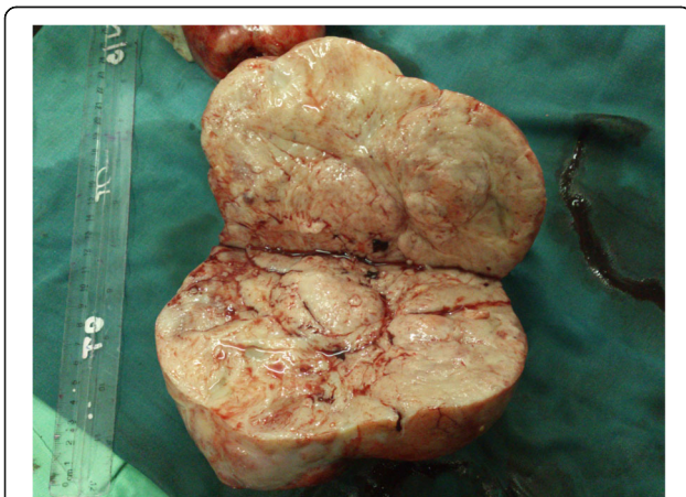
Fig. 1 Cut surface of right ovarian tumor

A bone marrow biopsy revealed 80% infiltration with lymphoid cells. Imaging showed enlarged lymph nodes above and below her diaphragm, ascites, and hepatosplenomegaly. Immunohistochemistry revealed focal CD20 staining and nuclear positivity for terminal deoxynucleotidyl transferase (TdT) and scattered CD3 positivity which suggested a B cell lymphoblastic lymphoma. Considering the blood count with bone marrow findings, a diagnosis of lymphoblastic lymphoma/leukemia was made according to World Health Organization (WHO) classification [8]. Cerebrospinal fluid (CSF) cytology was normal. Cytogenetics was not done due to financial constraints.