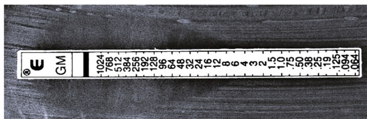
Fig. 1 The susceptibility of Enterococcus faecalis by E-test. Enterococcus faecalis in this case did not show high-level gentamicin resistance

Enterococcal endocarditis results in considerable mortality and cure rates of 72 to 79% are reported using standard therapy. Ampicillin monotherapy often results in clinical failures; therefore, aminoglycosides are added, because this combination enhances the bactericidal activity in vitro . Naturally, all enterococci display low aminoglycoside resistance; however, synergy is maintained with cell wall-active agents. High-level resistance to aminoglycosides abolishes the synergistic bactericidal activity of aminoglycosides in combination with cell-wall-active agents such as ampicillin, which are important in the treatment of severe enterococcal infections such as endocarditis. Enterococcal strains resistant to high levels of gentamicin (MIC > 512 mg/L) have been increasing among Enterococcus faecalis and Enterococcus faecium . In a study by Fernandez-Hidalgo et al. , 26% of 272 patients were infected by high-level aminoglycoside-resistant strains [19]. Therefore, a gentamicin-containing regimen would not be effective for these patients. Gentamicin-associated nephrotoxicity may complicate [20] a standard 4-week to 6-week course regimen and could result in serious, life-threatening complications, such as renal failure, requiring hemodialysis.