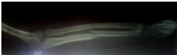
Fig. 2 X-ray of left forearm. Fracture of the shaft of the two bones of the forearm classified Orthopaedic Trauma Association/AO 22-A3

was made. Generalized tetanus was thus diagnosed a few hours after our patient's admission on the basis of the clinical examination in particular, and an obvious point of entry in an individual with unknown vaccination status who clinically presented a trismus, a generalized contracture, as well as paroxysms.