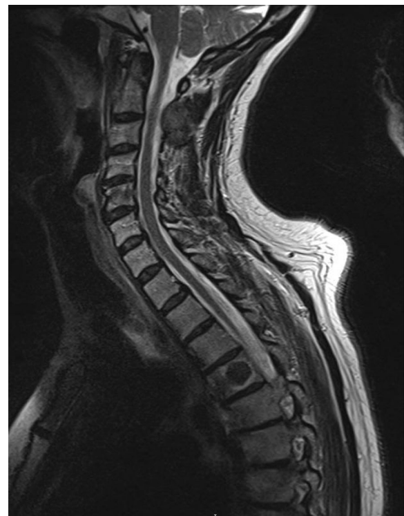
Fig. 1 T2-weighted sagittal magnetic resonance image demonstrating the deposits in C5 and T4. They appeared confined to the vertebral body with no evidence of vertebral body collapse

estimated glomerular filtration rate of 67 ml/minute/1.73 m 2 . The neck swelling was investigated with an ultrasound and confirmed both lateral cervical nodal disease in levels II to IV and a goiter with left-sided dominance. The fine-needle aspiration cytology (FNAC) of her thyroid was reported as in keeping with a papillary thyroid cancer; however, the cytology of the left lateral nodal disease was described as more suggestive of a breast malignancy. She had no personal or familial risk factors for thyroid malignancy. Staging investigations including magnetic resonance imaging (MRI) of her spine demonstrated stable deposits involving C2, C5, T4, and L1 without neural compromise (Fig. 1) and computed tomography (CT) of her thorax demonstrated no change in the lung nodules (Fig. 2). Since the diagnosis was not clear, following a multidisciplinary team discussion the decision was made to proceed with a total thyroidectomy and a clearance of the central compartment lymph nodes coupled with an excision biopsy of the laterocervical lymph nodes. Histopathological analysis of the specimen demonstrated an ill-circumscribed white tumor at the posterior margin of the left lobe measuring 1.2 × 0.9 × 1.5 cm. On immunocytochemistry the tumor cells were positive for carcinoembryonic antigen (CEA), synaptophysin, GATA3, and ER (5/8), focally positive for cytokeratin (CK) 7 and gross cystic disease fluid protein 15 (GCDFP-15), and