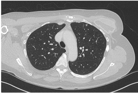
Fig. 2 Computed tomography of the thorax demonstrating a small (5 mm in diameter) subpleural nodule within the anterior left upper lobe, which remained unchanged since the previous scan

negative for thyroid transcription factor 1 (TTF-1), calcitonin, thyroglobulin, CK20, PR, and HER2. The overall appearances were consistent with metastatic breast cancer (Figs. 3 and 4) with no evidence of a primary thyroid malignancy. The level IV and level VI lymph nodes contained metastatic breast cancer. She was discharged on daily 125 mcg of levothyroxine. The chemotherapy was switched to 500 mg intramuscular monthly injections of fulvestrant and she continues to take the ibandronic acid. Currently, 14 months following the thyroidectomy, she remains clinically stable. She developed local recurrences in the level II to IV lymph nodes in her neck and a recent MRI of her spine showed stable spinal metastatic disease.