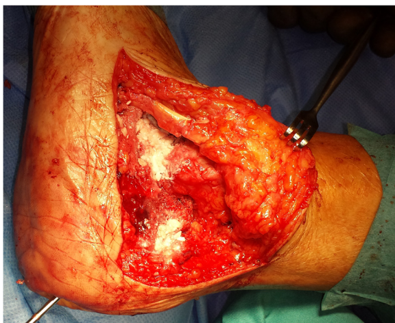
Fig. 3 A heterologous cortico-cancellous collagenated pre-hydrated bone mix was used for spongioplasty

is a resorbable collagen membrane, which prevents in-growth of unwanted cells and allows the passage of desired cells. In manufacturing the heterologous bone, the antigenic components are neutralized but the collagen matrix is preserved inside the granules of the biomaterial. Collagen has a key role in the bone regeneration process: (1) it acts as a valid substrate for platelet activation and aggregation; (2) it serves to attract and differentiate the mesenchymal stem cells in the bone marrow; (3) it increases the proliferation rate of osteoblasts by up to three times; and (4) it stimulates the activation of the platelets, osteoblasts, and osteoclasts in the tissue healing process [13, 14].