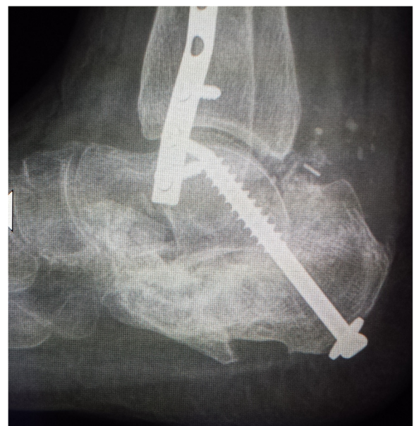
Fig. 5 Final result after 1.5 years after operative treatment