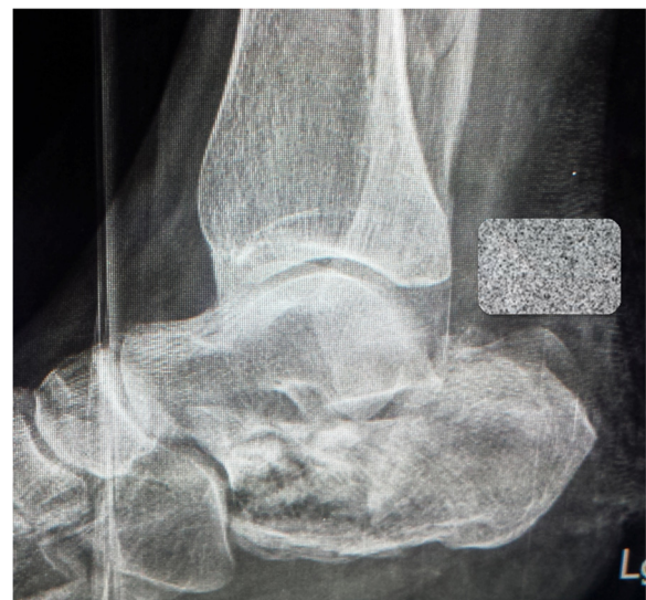
Fig. 1 X-ray of calcaneal fracture after injury

Four weeks after the subtalar arthrodesis, a plain X-ray showed good incorporation of the graft. Eight weeks later, the wound had healed properly and she was