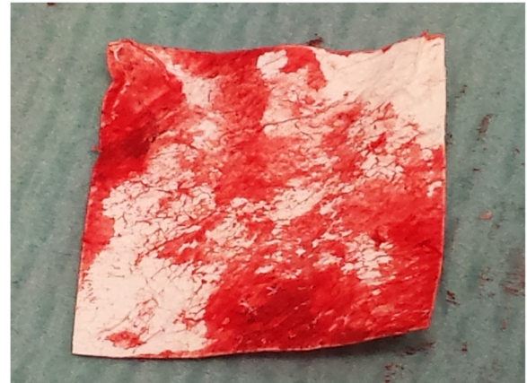
Fig. 4 A heterologous collagen membrane was first moistened with our patient's blood to soften it and allow adjustment to the surface of the operative wound

allowed to begin full weight-bearing. The graft was fully incorporated 12 weeks after the procedure.