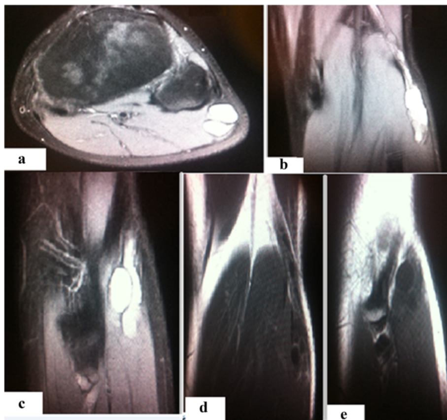
Fig. 1 Magnetic resonance imaging. a Proton density fat-saturated cross-section showing a lesion projecting on to the upper outer quadrant of the patient’s popliteal fossa, a rounded area of high signal intensity and a few thin septa. b Proton density fat-saturated coronal section showing a lesion projecting on to the upper outer quadrant of the popliteal fossa, a heterogeneous area of high signal intensity and a few thin septa. c Proton density fat-saturated sagittal section showing a lesion projecting on to the upper outer quadrant of the popliteal fossa, a heterogeneous oblong area of high signal intensity and a few thin septa. d Coronal T1 sequence after gadolinium injection showing peripheral contrast enhancement and septa at the upper outer quadrant of the popliteal fossa. e Sagittal T1 sequence after gadolinium injection showing peripheral contrast enhancement and septa at the upper outer quadrant of the popliteal fossa

Compression of the EPSN frequently occurs in association with lesions at the neck of the fibula, which represents 54 % of such cases, trauma represents 40 % and a tumor origin represents only 6 % [1]. No cases of neurofibroma were mentioned in the series reported by Piton et al. [1]. After a review of the literature, we found only five cases of neurofibroma in relationship with EPSN, but none in relationship with its collaterals [3–5]. In the case of Mizutani et al. , neurofibroma was found in the lumbosacral region [4]; in the case of Cebesoy et al. , a neurofibroma involving the EPSN was a plexiform neurofibroma [5]. All cases are presented in Table 1. Ours is the first reported case of a neurofibroma of the EPSN collaterals. In fact, no tumor was present at the EPSN; instead,