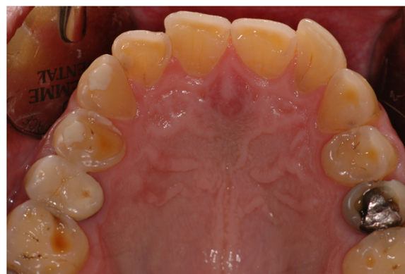
Fig. 5 Erosion of the palatal surfaces and intact enamel borders along the gingival margin

Currently, internationally accepted clinical criteria (Rome III criteria) are extensively used to diagnose FGIDs [6]. The Rome III Criteria were developed by a committee that recommended the pragmatic description of FD to be the presence of symptoms such as epigastric pain, epigastric burning, post-prandial fullness and early satiation in the absence of any organic, systemic, or metabolic disease that is likely to explain the symptoms. Furthermore, Rome III criteria help to distinguish whether patients report symptom aggravation after ingestion of a meal, the so-called PPDS characterized by postprandial fullness and early satiation, or meal-unrelated dyspeptic symptoms, the so-called epigastric pain syndrome (EPS), characterized by epigastric pain and epigastric burning [6]. A distinction between meal-related and meal-unrelated symptoms has been demonstrated as clinically relevant for disclosing differences