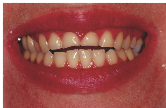
Fig. 3 The altered smile-line caused by the erosion of the incisal edges

A complete medical assessment was obtained, and no relevant medical risk was reported. However, during the intra-oral assessment the aspect of the dental erosion suggested recurrent vomiting (Fig. 4), but she denied vomiting and having eating habits such as Coke-swishing or vegetable and/or fruit-mulling. Since she also had a body mass index (BMI; weight in kilograms divided by height in meters squared) of 18.5, she was referred to our GI outpatient clinic to investigate this unexplained weight loss. In our tertiary level-of-care referral center she underwent a careful medical history with detailed dietary information and physical examination. She had been complaining of a