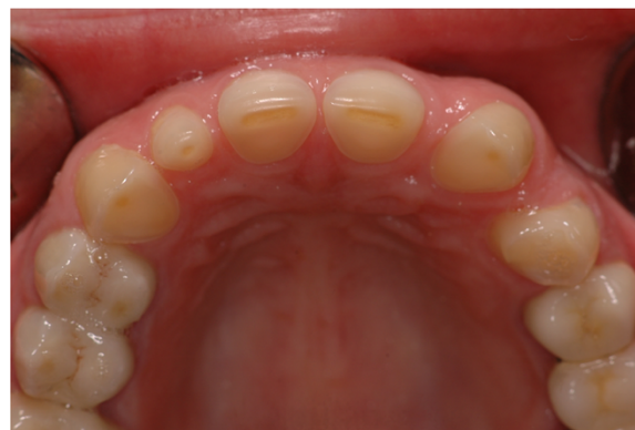
Fig. 2 Erosion with the involvement of dentin

the final diagnosis of AN, which required psychiatric treatment.