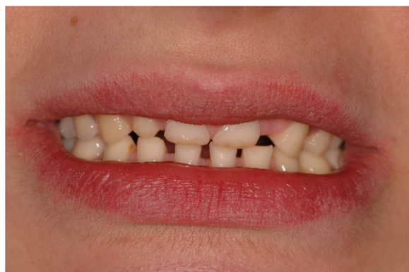
Fig. 1 Severe alteration of the patient's smile

The dentist diagnosed dental erosion of the maxillary anterior teeth, in particular the lingual and incisal surfaces (Fig. 2). Then, he asked the patient about any previous episodes of recurrent vomiting, of any eating habits such as Coke-swishing or vegetable and/or fruit-mulling; however, her answer was negative. In consequence, the dentist had a meeting with gastroenterologists and the suspicion of an ED was raised. At the second more careful gastroenterological assessment, the patient also tested positive for FD, specifically PPDS. Therefore, the suspicion of an ED became even stronger, and a psychiatric evaluation was planned reaching