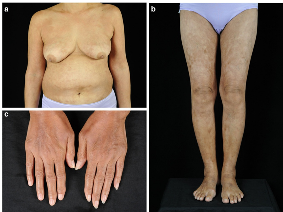
Fig. 1 Clinical presentation. a, b Widespread reticulate hyperpigmentation over the trunk and extremities with discrete erythematous indurated plaques over the chest wall and anterior abdomen, c Sclerodactyly with cool periphery of all fingers