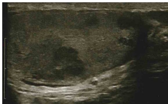
Fig. 1 Scrotal ultrasound. Structural changes of the entire right testis

showed mostly regular tubules with normal spermatogenesis, despite the macroscopic findings. Careful examination of the entire lesion allowed us to rule out teratoma. Immunohistochemically, the tumor was positive for cytokeratin (CK) 7 and CK20 (focal) and negative for placental alkaline phosphatase (PLAP), AFP, \beta -hCG, calretinin, and inhibin, with a Ki67/MIB1 proliferation index of 15%.