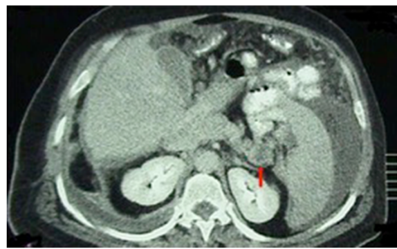
Fig. 3 Computed tomographic scan. Densitometric alteration of the tail of the pancreas can be seen (inhomogeneous hypodensity, red arrow)