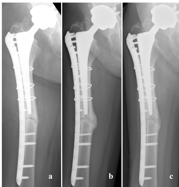
Figure 3 Radiographs obtained after osteosynthesis. (a) Just after the surgery. (b) At 6 months after surgery. (c) At 2 years after surgery.

She regained the ability to walk, although her activity was limited by her comorbidities, especially interstitial pneumonia. The latest follow-up was performed 2 years after the fracture surgery. She had no pain in her right hip joint or thigh. She could walk with a cane at home and used a wheelchair outside the home. A radiographic examination revealed no displacement or loosening of the implants, and the fracture site had remodeled well (Figure 3).