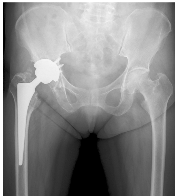
Figure 2 Radiograph taken at the 3-year follow-up of total hip arthroplasty (8 months before the fracture) showing no abnormal findings.

prior smoker, having stopped 21 years ago. She did not drink alcohol. She had other past medical histories. Hemithyroidectomy was performed for a thyroid tumor 23 years ago, and she took thyroid hormone preparation. She also had necrotizing fasciitis of the anterior cervical region that had spread from a gingival abscess 7 months ago. In addition, she underwent total hysterectomy, although she did not remember exactly when it took place. She had been taking an anti-hypertension drug and an H 2 blocker for some time.