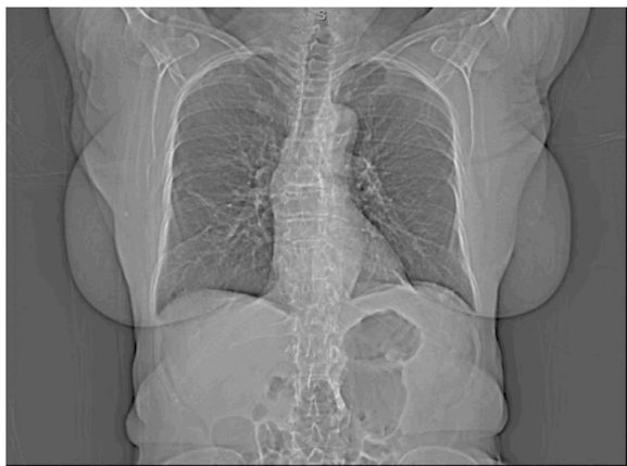
Figure 1 Coronal view of a computed tomography scan of the chest.

We report a case of pseudoachalasia due to metastatic LCNEC of the lung in a 68 year-old woman, with mild onset of symptoms for two years prior to substantial weight loss. Over one year after her surgery, our patient had normal findings on an EGD, chest CT and PET scan. Her manometric and radiological findings were consistent with progressive achalasia. Although it might be difficult to diagnose in an early phase, it is very uncommon for a patient with metastatic pseudoachalasia to maintain weight and clinical stability for a period as long as over two years before establishment of luminal findings.