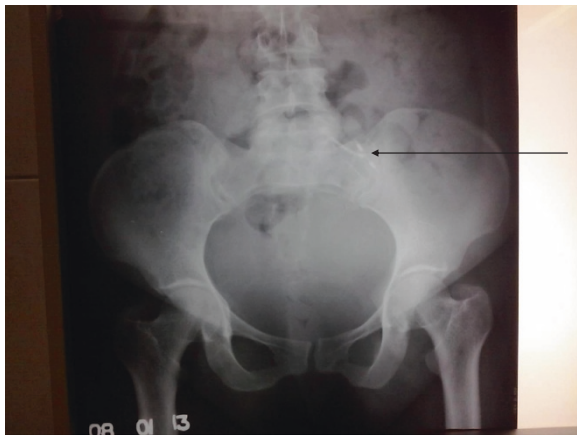
Figure 1 Anteroposterior X-ray of pelvis showing the intrauterine device (arrowed).

uterus. Retrieval was therefore abandoned and she was transferred to a high-volume surgical unit.