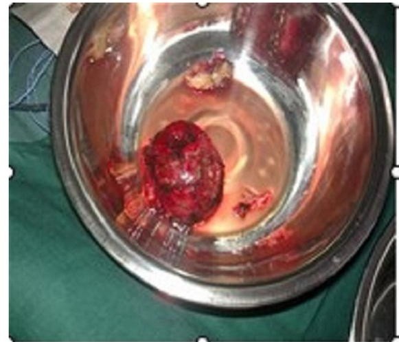
Figure 2 Intraoperative invasion. Tumor invasion of the skull was noted during the surgery.

Our patient then underwent surgery to resect the subcutaneous tumor and evacuate the intracranial hematoma under general anesthesia. An incision was made along the one from the original surgery. During the operation, it became apparent that the main part of the tumor was located in the subcutaneous tissue of his right frontal region. The tumor was approximately 7cm×6cm×4cm (Figure 2), fully enveloped, and characterized by abundant revascularization. The cyst of the tumor was intact, and his temporal muscle tissue was thin. His cranial periosteum and cerebral dura mater were invaded by the tumor, resulting in a thin, brittle skull (Figure 3). His dura mater was also thin and light yellow in color. The tumorous hemorrhage extended into his intracranial tissue, but no tumor tissue was seen in his subdural area. The intracranial hematoma was successfully removed during the operation (70mL from the right frontal part, 20mL from the intraventricular hematoma). The subcutaneous tumor was totally resected along with some affected cranial tissues. The epidural bleeding was completely stopped. However, the temporal muscle fascia was incomplete because of the