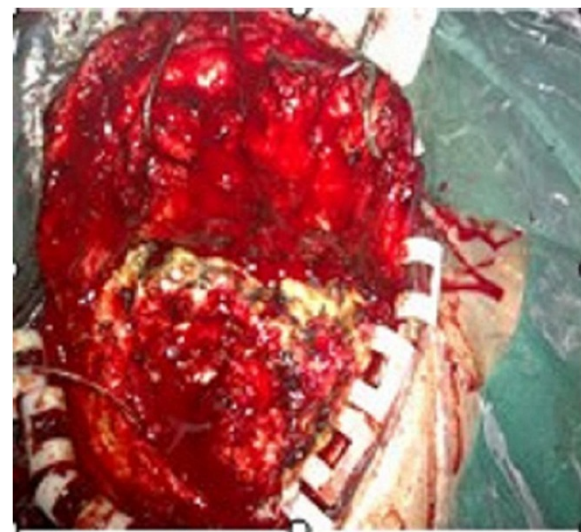
Figure 3 Tumor resection. The tumor was completely resected and measured 7cm×6cm×4cm.