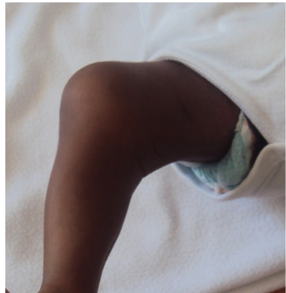
Figure 3 Right popliteal pterygium.

p.Arg84Cys mutation in exon 4 (Figure 4). This mutation occurred de novo , as it was not revealed in the hematologic cells of the parents.