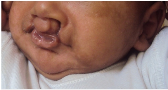
Figure 1 Index case showing a bilateral cleft lip with two large pits on his lower lip and achromic spots in his face.

physical examination, our patient had a bilateral cleft lip and palate with two large pits on the lower lip and oral synechias that did not restrict feeding (Figure 1). He presented several achromic spots of different shapes and sizes on his face. They were irregular but with a well-defined border. On Wood lamp examination, they appeared off-white. There was an asymmetrical large-size pigmented nevus on the sole of his right foot, without relevant nails anomalies (Figures 1 and 2). He also had right popliteal pterygium and bilateral syndactyly of four to five toes (Figure 3). The urogenital examination showed a phimosis. X-rays of the skull, transfontanellar, abdominogenitourinary and cardiac ultrasonography were normal. The results of all laboratory examinations were within normal limits. Informed consent was obtained from the proband's parents prior to molecular analysis. Peripheral blood was collected from the affected child and his parents. Molecular genetic testing for suspected PPS was performed by Sanger sequencing of the entire coding region and flanking introns of the IRF6 gene (NM_006147.3). This led to the identification of the heterozygous c.250C>T;