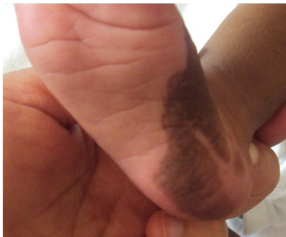
Figure 2 Verrucous hamartoma on the sole of our patient's feet.

physical examination, our patient had a bilateral cleft lip and palate with two large pits on the lower lip and oral synechias that did not restrict feeding (Figure 1). He presented several achromic spots of different shapes and sizes on his face. They were irregular but with a well-defined border. On Wood lamp examination, they appeared off-white. There was an asymmetrical large-size pigmented nevus on the sole of his right foot, without relevant nails anomalies (Figures 1 and 2). He also had right popliteal pterygium and bilateral syndactyly of four to five toes (Figure 3). The urogenital examination showed a phimosis. X-rays of the skull, transfontanellar, abdominogenitourinary and cardiac ultrasonography were normal. The results of all laboratory examinations were within normal limits. Informed consent was obtained from the proband's parents prior to molecular analysis. Peripheral blood was collected from the affected child and his parents. Molecular genetic testing for suspected PPS was performed by Sanger sequencing of the entire coding region and flanking introns of the IRF6 gene (NM_006147.3). This led to the identification of the heterozygous c.250C>T;