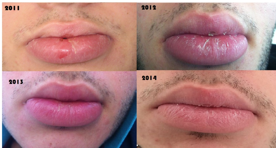
Figure 2 Modification of lip swelling. The figure shows gradual changes in lip swelling in our patient since the beginning of infliximab therapy.

Intestinal Crohn's disease is accompanied by a number of disease-specific oral lesions, such as swelling of the lips, buccal mucosal swelling or cobble stoning, mucogingivitis, deep linear ulceration, perioral erythema with