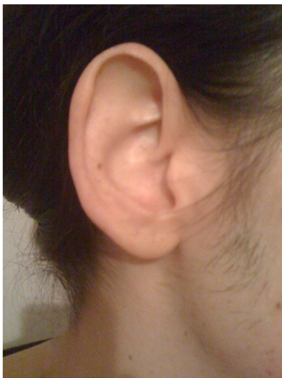
Figure 1 Normal appearance of the right ear of the patient (photograph taken by patient).

These symptoms caused our patient considerable distress, resulting in weekly attendance for three months at her general practitioner's clinic, in addition to presentation at the local emergency departments and to ear, nose