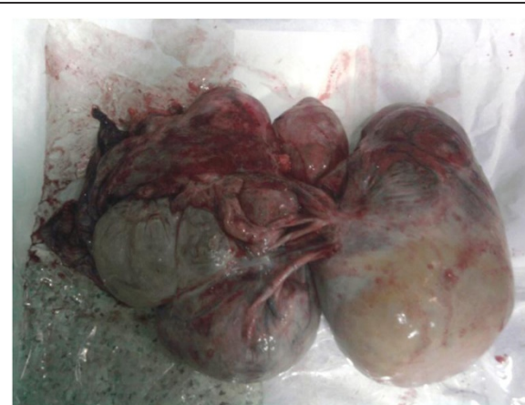
Figure 2 Abdominal tumor encapsulated after resection surgery.