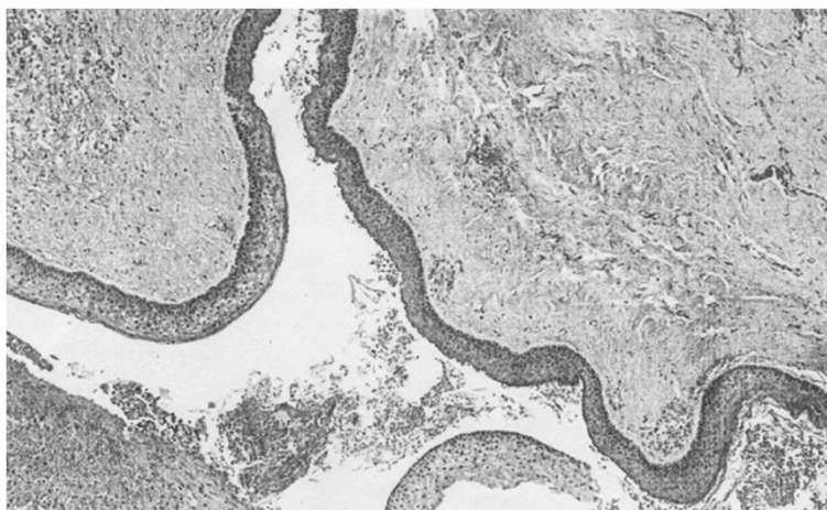
Figure 2 Histological study of the patient's keratocystic odontogenic tumor. Image shows cell layers of squamous parakeratotic epithelium and areas of dehiscent epithelium with granulation tissue.

occasionally show features of epithelial dysplasia, and the potential for malignant transformation into squamous cell carcinoma, though rare, has been reported [7,8,11].