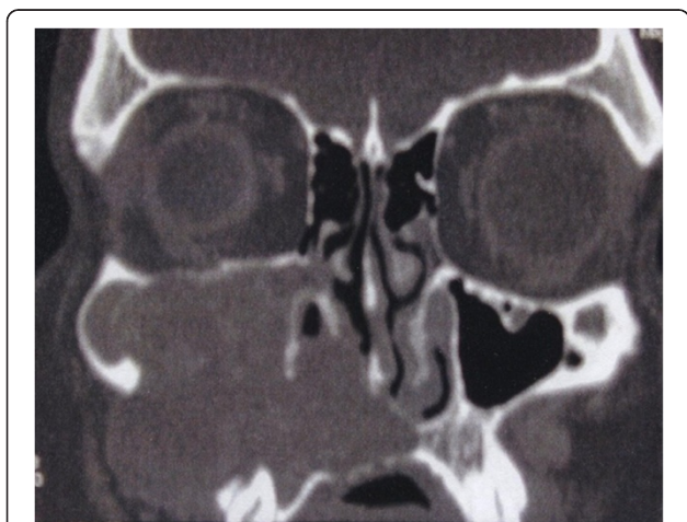
Figure 1 Pre-operative computed tomography scan. Image shows a solid neoplasm occupying the right maxillary sinus, erosion of the anterior and posterior walls of the sinus and mass extension to the corresponding right dental roots and the nasal cavity, with compression and deflection of the nasal septum. There was no enhancement after contrast administration.

To remove the mass, ESS was performed. After surgical volume reduction using radiofrequency of the inferior turbinate, the maxillary ostium was enlarged and the cystic lesion was opened and decompressed. Marsupialization was performed, and the cystic wall was also removed as much as possible.