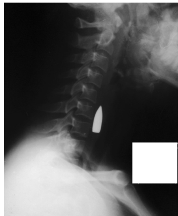
Figure 3 Lateral radiograph of the head and neck. This shows a bullet lodged in the neck, anterior to the bodies of cervical vertebrae 6 and 7.