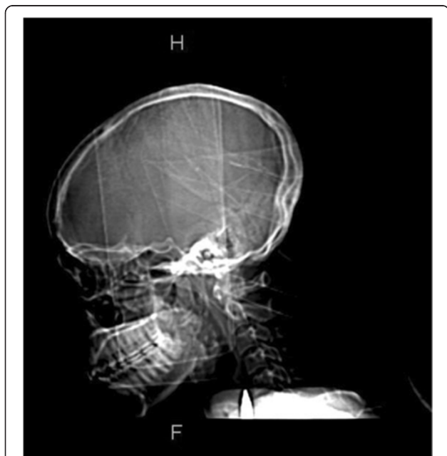
Figure 4 Computed tomography scan of the head and neck. The scan shows a cephalad shift of the bullet to lie partially anterior to the fifth cervical vertebra. There is also a comminuted fracture of the angle and ramus of the right mandible. The section is through the median sagittal plane.

We were faced with a scenario of a GSI to the right side of her head. Given the distance of about 70m, we expected substantial injury; a GSI to the head is often immediately fatal. It was a penetrating type of injury, although avulsion per se was also possible [4]; a 6cm-long wound. What is