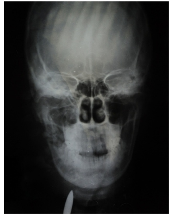
Figure 2 Anteroposterior radiograph of the head and neck. This shows a bullet in the right side of the neck. Comminuted fracture of the mandible (angle and ramus) and maxillary antrum are revealed.

A plain radiograph of her head and neck (Figures 2 and 3) and an ultrasound scan of her neck, done prior to her referral, had revealed the presence of a bullet in the right side of her neck, anterior to cervical vertebrae