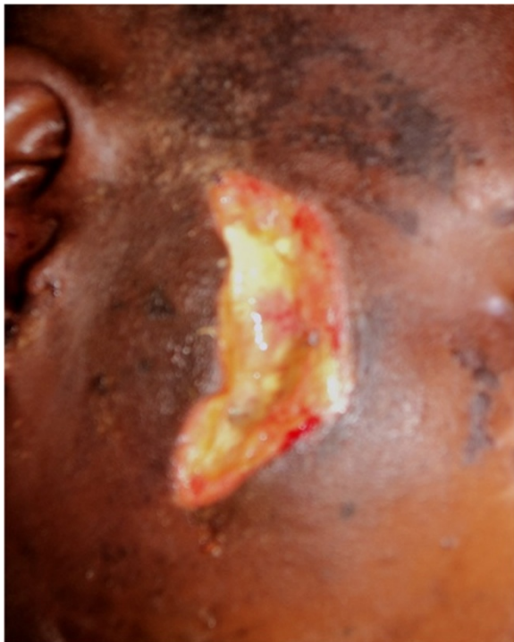
Figure 1 Photograph showing an atypical bullet entry wound. Appearance of the wound 10 days after injury. There is evidence of suppuration and areas of granulation tissue formation.