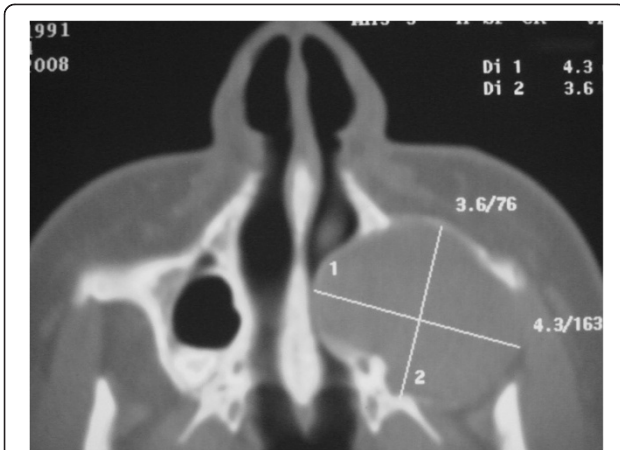
Figure 4 Computed tomography scan: axial sections.