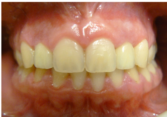
Figure 13 Completed case.

Concerning the etiopathogenesis of dental agenesis, the hereditary theory (Brook [15]; Magnusson [16]; Graber [17]; Ahmed et al. [18]) highlights a dominant autosomal transmission, with reduced penetrance and variable expression in terms of the number and region of the missing teeth. Genetic surveys of members of families with