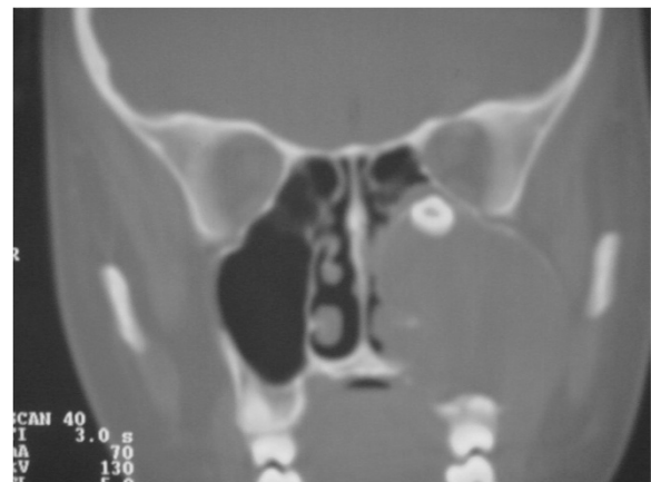
Figure 3 Computed tomography scan: coronal sections.

To determine the origin of the lesion and the best surgical approach, an axial computed tomography (CT) scan of the facial skeleton was requested. The coronal section showed complete opacity of the left maxillary sinus, involvement of ethmoidal cells (Figure 3), and dislocation of tooth 2.8 in the sinus. The axial projection showed a large, oval-shaped area of osteolysis, measuring 3.6 \times 4.3 mm, with deformation and erosion of the buccal cortical bone (Figure 4). Considering this erosion, we immediately performed a needle biopsy of the lesion. The lesion was hemorrhagic and purulent, typical of an infected cyst. After a careful evaluation, we chose antral-cystectomy with the Caldwell-Luc technique, under general anesthesia, as the treatment for removal of the lesion and the infected sinus mucosa.