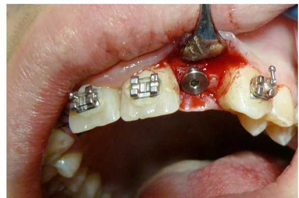
Figure 11 Details of implant on 2.2.

Patched (PTCH) is the receptor for secreted sonic hedgehog (SHH) protein. Normally, PTCH forms a receptor complex with the product of the oncogene