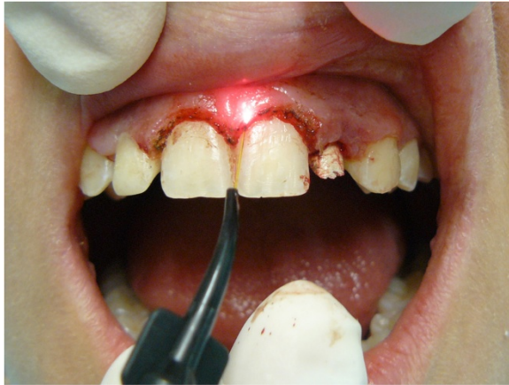
Figure 12 Gingivectomy with Nd:YAG laser.