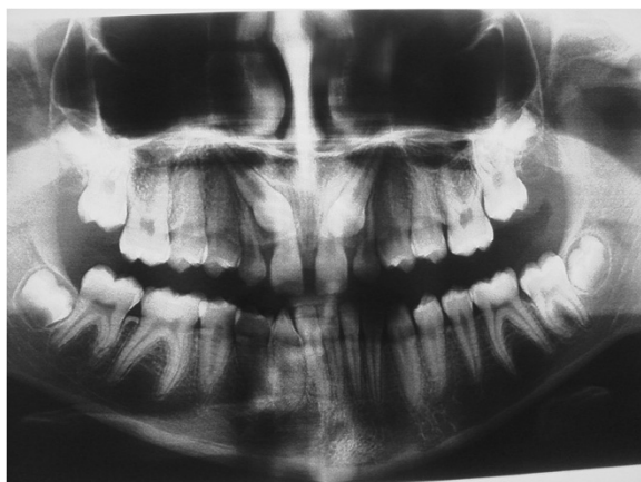
Figure 1 Orthopantomography with agenesis of 1.2 and 2.2.

Here, we report the case of a 14-year-old Caucasian girl, who presented with bilateral agenesis of the upper incisors, diagnosed via orthopantomography (OPG) (Figure 1) and skull X-ray in the laterolateral projection. Approximately one year after starting orthodontic treatment, our patient came to the emergency department because of a phlegmonous tumefaction of the lateroposterior upper left maxillary region. A careful intraoral examination revealed remarkable swelling and mobility of teeth 26 and 27, which were positive to vitality tests. OPG (Figure 2) revealed a large area of unilocular osteolysis, with a calcific