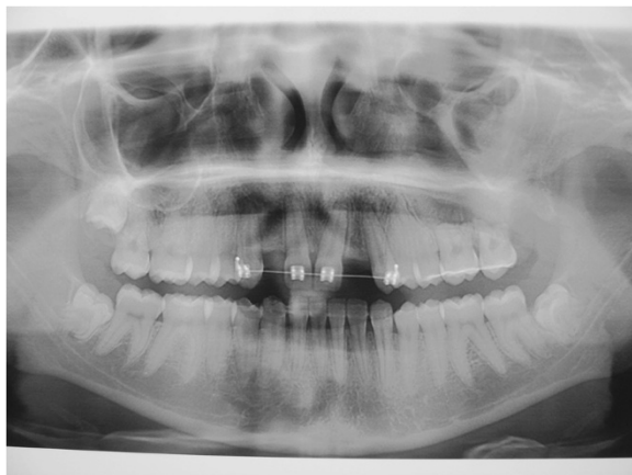
Figure 8 Orthopantomography follow-up after 6 months.

detect a possible causal relationship between KCOT and agenesia.