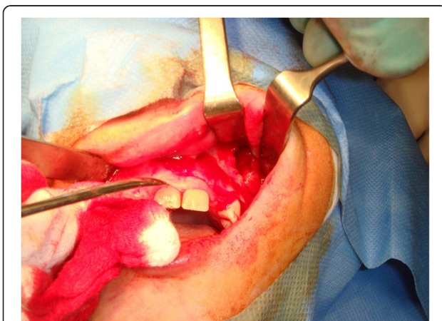
Figure 5 Opening of the flap.

The KCOT showed a typical undulated pattern in the epithelium, accompanied by parakeratinization and exfoliation of keratin in the lumen (Figure 7). Clinical and imaging follow-ups at 6, 12, and 24 months showed good bone trabeculation in the area of the KCOT (Figures 8, 9 and 10), and positive pulp vitality results for teeth 2.6 and 2.7. Probing indicated healing of the periodontal area.