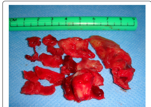
Figure 6 Macroscopic findings.

A large mucoperiosteal incision was made to create a mixed flap (marginal-paramarginal) from the central contralateral incisor to the maxillary tuberosity (Figure 5). Removing the flap revealed a large opening in the cortical bone. The maxillary sinus was emptied through complete enucleation of the keratocyst and removal of the ethmoidal membrane, including the eighth. The removed lesion (Figure 6) was immersed in 10 percent formalin and sent to a pathologist for histological examination. Teeth affected by the lesion were stabilized by interocclusal splinting with wrought metal wire. A histological diagnosis of 'odontogenic keratocyst with a specific flogistic and chronic focus' confirmed the clinical suspicion.