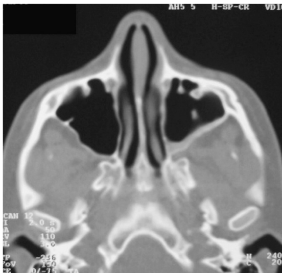
Figure 9 Computed tomography axial projection at 12 months.

The question of whether keratocysts are malformations or neoplasms has been the subject of long debate. Whereas some authors claim that a keratocyst develops from a distal extension of the dental lamina, others think it is derived from the basal layer of the oral epithelium.