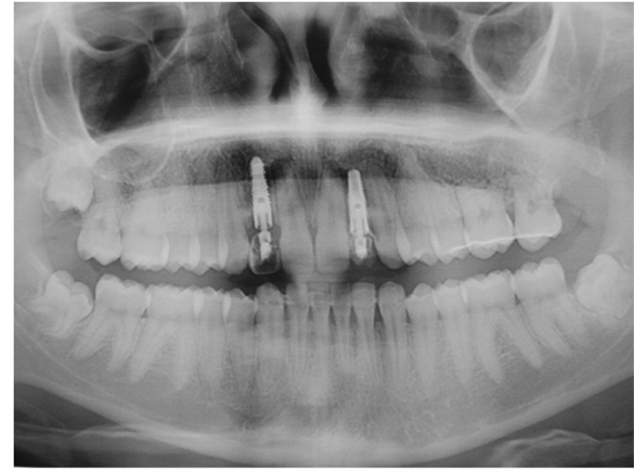
Figure 14 Orthopantomography examination at 24 months.

Smoothed ( SMO ), through the SHH ligand. The interaction between PTCH and SMO inhibits translation of the growth signal. If the normal functioning of PTCH fails, then the proliferation-promoting effects of SMO become dominant [7,9]. SMO is an oncosuppressor that is important for the embryonic development of neural tubes, skeleton, limbs, lungs, hair follicles, and teeth. Mutations of SMO can be found in keratocysts in Gorlin-Goltz syndrome, as well as in sporadic keratocysts. The above findings constitute clinical and molecular evidence for the conclusion that keratocysts are neoplasms characterized by local aggressiveness (see [3]), and should be referred to as 'keratocystic odontogenic tumors' [1-3,13,14].