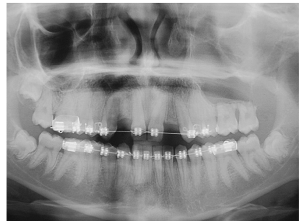
Figure 2 Dental panoramic radiograph.

peripheral edge in the left maxillary sinus; radicular resorption of teeth 26 and 27; and the absence of tooth 28, which had been present in the previous radiographic examination (Figure 1).