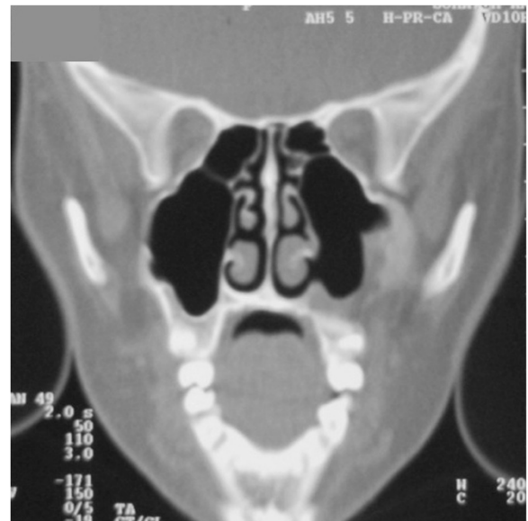
Figure 10 Computed tomography coronal projection at 12 months.

Most authors agree that the neoformation shows an expanding growth type, similar to maxillary cysts [10,11]. Keratocysts have an actively proliferating epithelium. They exhibit high numbers of cells positive for Ki67, proliferating cell nuclear antigen (PCNA), and p53 compared to other odontogenic cysts [12]. PCNA and Ki67 are proliferation markers that are expressed during mitosis. The oncosuppressor p53 favors cell apoptosis, and is frequently mutated or overexpressed in neoplasms. From these observations, we can deduce that B-cell lymphoma-2 (Bcl-2), matrix metalloproteinase (MMP)-2 and -9, transforming growth factor (TGF), and interleukin (IL)-1a and -6 are overexpressed in keratocysts.