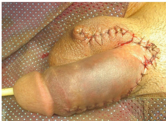
Figure 2 The replantated penis showed considerable edema of the skin, of the penile shaft and the prepuce.

Many factors contribute to favorable final outcomes: the degree of injury, type of injury (crushed, lacerated, or incised), duration of warm ischemia, the equipment used, and experience of the operative team [5]. Analysis of our case revealed that the cleanly incised injury, with incomplete section of penis involving both corpora cavernosa and the spongy body, with a short duration of