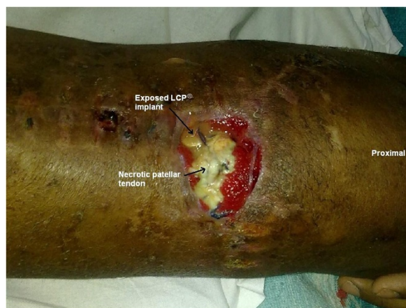
Figure 1 Photograph showing Y-shaped scar over the left knee with raw area exposing necrotic patellar tendon and proximal medial locking compression plate implant.

A 15cm longitudinal incision was made 3cm behind the posteromedial border of the tibia; the medial gastrocnemius muscle was raised as a flap along with its distal tendinous portion (hemi-Achilles tendon) through this incision and was used to cover the antero-medial side of