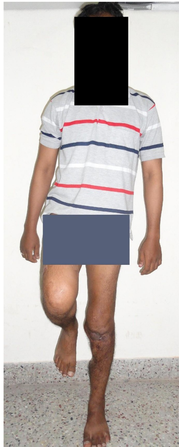
Figure 8 Photograph showing our patient able to stand on the operated left leg alone without support, one year after surgery.

to either the medial or lateral belly of the muscle [4]. Therefore, the soleus can be split longitudinally along the median raphe to create a muscle flap composed of only half of the muscle. The most significant advantage of the