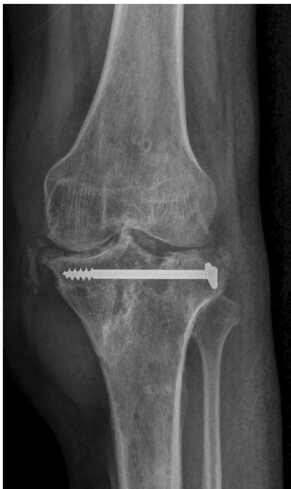
Figure 7 Radiograph (antero-posterior view) of our patient's left knee and leg, taken one year after surgery, showing the proximal tibia fracture united.

We used only the medial gastrocnemius and the medial hemisoleus muscles in our patient's case and the intact lateral halves of the muscles allow preservation of foot plan-tar flexion. Also, previous anatomic studies of the soleus muscle clearly demonstrate the bipenniform morphology of the muscle and the independent neurovascular supply