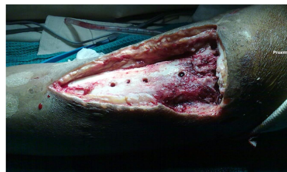
Figure 2 Photograph showing the soft tissue defect over the anterior and medial aspects of the left knee and proximal leg after debridement.