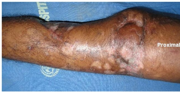
Figure 6 Photograph of our patient's left leg showing all three flaps healed well with no infection at one year from surgery.

We used only the medial gastrocnemius and the medial hemisoleus muscles in our patient's case and the intact lateral halves of the muscles allow preservation of foot plan-tar flexion. Also, previous anatomic studies of the soleus muscle clearly demonstrate the bipenniform morphology of the muscle and the independent neurovascular supply