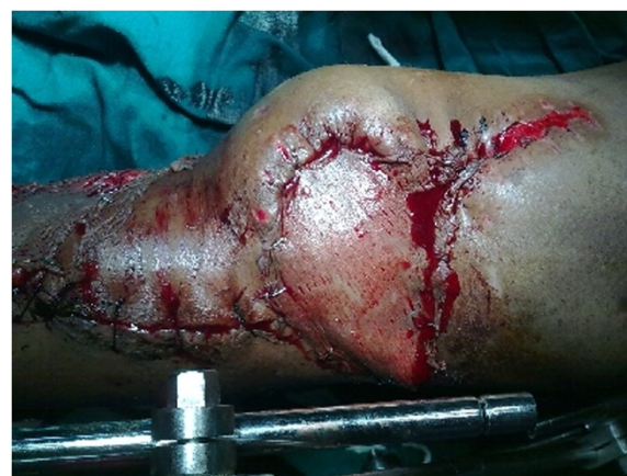
Figure 5 Photograph of left knee and leg showing the medial gastrocnemius flap covered with a split thickness skin graft used for extensor reconstruction, the saphenous fasciocutaneous flap rotated to cover the upper part of defect and the medial hemi-soleus covered with a split thickness skin graft in the lower part of the defect.

Park et al. [3] were presented with such a situation after wide debridement for infection after an open reduction and internal fixation of an open, comminuted, patellar fracture. They reported using an extended medial gastrocnemius flap (EMGF) including a tendinous portion of the Achilles for reconstruction of the quadriceps mechanism along with a saphenous neurocutaneous flap (SNCF) for the additional soft tissue coverage around the proximal tibia and patellar tendon [3]. This was the first and only report documenting the use of dual flaps for the treatment of quadriceps mechanism reconstruction and concomitant soft tissue coverage around the knee. To the best of our knowledge there has been no report to date documenting the use of three simultaneously elevated flaps for the management of knee extensor mechanism loss and concomitant soft tissue defect extending up to the middle third of the leg.