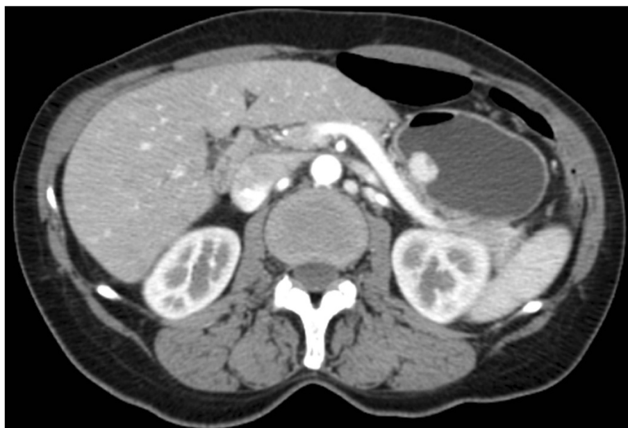
Figure 2 Abdomen computed tomography scan showed a gastric polyp with arterial enhancement and an apical area of necrosis.

neoplastic tissue in the corpus of her stomach. Thiazine staining for H. pylori was negative. Total body computed tomography showed no evidence of lymph node or hepatic metastases and confirmed a hypervascular 1.7 \times 1.3 cm polyp in the stomach (Figure 2). The patient underwent a gastric tangential resection, restricted to the portion of corpus of gastric wall involved by tumor and sparing almost all of the stomach (Figure 3). Microscopic examination confirmed a well-differentiated, low-grade, neuroendocrine tumor of the stomach infiltrating the submucosal layer with microvascular invasion. The margin of the resection was free of disease. Postoperative staging was pT1 according to the Union for International Cancer Control's TNM Classification of Malignant Tumours (7th edition). The patient's postoperative course