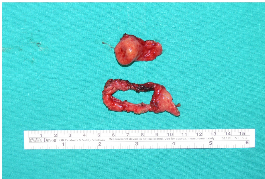
Figure 3 A gross photograph of the gastrectomy specimen showed a polyp (two cm in diameter) with an apical area of necrosis and the resected mucosal ring.

was uneventful and she remained in a good clinical condition. Six months later, her serum gastrin was 2011 pg/mL. A total body computed tomography scan and an upper gastrointestinal endoscopy excluded recurrence of the disease. A gastric antral biopsy showed mild chronic atrophic gastritis and intestinal metaplasia. Staining for H. pylori was negative. Immunohistochemical staining for cytokeratin and synaptophysin showed mild hyperplasia of neuroendocrine gastric cells. No tumor recurrence was revealed.