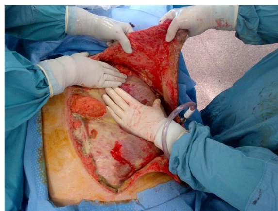
Figure 3 Large triangular skin flaps.

and dressing change were required. A total of four subsequent washouts were required. Although he initially suffered significant acute kidney injury, as well as sepsis (white blood cell = 48,000 per cubic millimeter of blood) requiring vasopressor support, these physiologic parameters improved to normal within three days. Final microbiology results confirmed Clostridium perfringens . Intravenous immunoglobulin was not required.