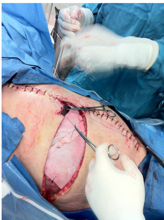
Figure 5 Closure of skin flaps over the abdominal wall reconstruction.

Although up to 80% of necrotizing soft tissue infections are polymicrobial, Clostridium species are still associated with the classic presentation of gas gangrene myonecrosis [3]. Typically the presence of soft tissue gas, as observed in this patient, offers a grave prognosis [4]. In addition, gas gangrene of the torso carries an even worse outcome given the typical requirement for radical full thickness debridement that often results in open abdominal and thoracic cavities with exposed viscera [2]. Because of the tremendous risks associated with soft tissue coverage and eventual reconstruction, our patient underwent an alternative strategy. By maintaining two large, well-vascularized subcutaneous flaps as potential coverage, in addition to the internal oblique aponeurosis as a barrier to the peritoneal cavity, we were able to maintain significant reconstructive options. Given the risk inherent in this initial approach,