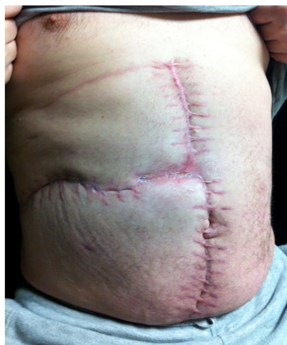
Figure 6 Abdominal wall 12 months after the reconstruction.

the patient was returned to the operating room for a second tissue evaluation only eight hours after the initial debridement. As a consequence of his radical improvement in physiology and tissue quality, we persisted with this methodology.