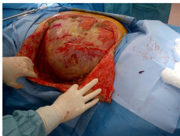
Figure 2 Intact transversus abdominus layer following resection of the external and internal oblique aponeuroses, rectus muscles, and a portion of the pectoralis muscle.

Immediate antimicrobial support and operative intervention led to resection of the entire external oblique and transversus abdominus aponeuroses, rectus muscles, and a portion of the pectoralis muscle of the patient's right torso (Figure 2). The tissues displayed the classic brown dishwater appearance. The internal oblique aponeurosis and two large triangular skin flaps were left intact (Figure 3). It should be noted that the small laparotomy incision was re-opened to ensure the absence of a missed bowel injury or intraperitoneal source of the contamination. A negative pressure dressing was then applied superficial to the internal oblique layer, followed by loose approximation of the large skin flaps. The patient was returned to the operating room eight hours later because minor additional debridements, washout,