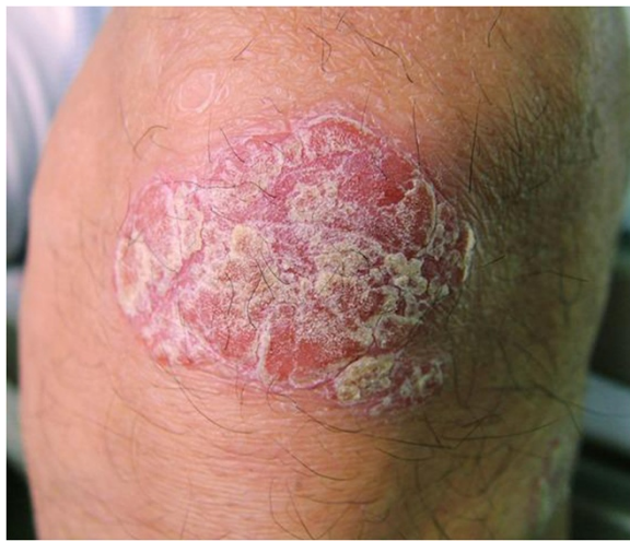
Figure 1 Psoriatic lesion on the knee.

Routine blood laboratory tests were normal. His serum concentration of immunoglobulin (Ig) M was 320mg/dL (normal range: 51 to 260mg/dL), but other immunoglobulins were within the normal range. Serum immunoelectrophoresis showed IgM K-type monoclonal gammopathy. An enzyme-linked immunosorbent assay confirmed that the serum obtained from our patient before treatment contained extremely high titers of IgM antibody against MAG and sulfated glucuronyl paragloboside. A MAG western blot analysis showed the presence of a 91 to 94kDa band using purified human MAG antigen. No tumor cell proliferation was observed in a bone marrow aspiration study. Autoantibodies, including anti-deoxyribonucleic acid (DNA), anti-SS-A and anti-SS-B were not detected. Assays for ganglioside antibodies against GM1, GM2, GM3, GD1a, GD1b, GD3, GT1b, GQ1b, GA1 and Gal-C were negative. The titer of cold agglutinin was not increased. There was no cerebral spinal fluid pleocytosis, but his cerebral spinal fluid protein level was 300mg/dL.