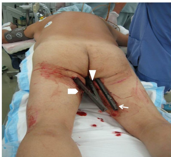
Figure 1 Patient impaled with three steel bars: bar A ( \Delta ; patient's left side), bar B ( \Delta ; center) and bar C ( \uparrow ; right).

With our patient under general anesthesia and in the lithotomy position, bars A and B were gently pulled and successfully removed. Next, a celiotomy was performed to remove bar C. Following the removal of bar C, bleeding from the anterior side of his sacral bone was controlled by gauze packing. The perineal wound was debrided and pre-sacral drainage was performed. The total volume of intraoperative bleeding was 4000mL, and 12 units of red cell concentrate and six units of fresh frozen plasma were transfused. Imipenem/cilastatin and clindamycin were preoperatively administered. After the surgery, our patient