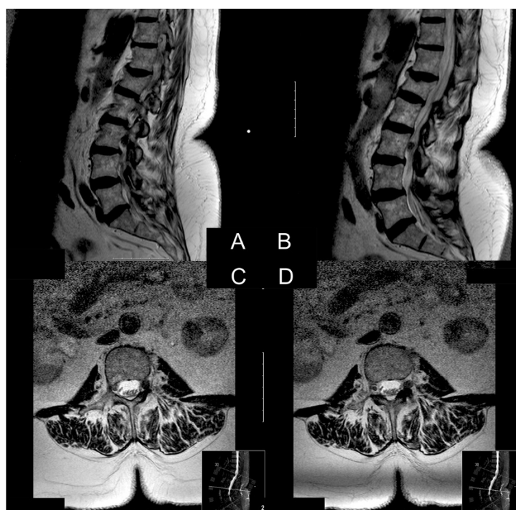
Figure 1 Preoperative magnetic resonance imaging. (A) Sagittal non-enhanced T1-imaging. (B) Sagittal T2-imaging. (C, D) Axial T2-imaging. An unclear structure in the neuroforamen of the L3 left nerve root not clearly delimitable. There was no clear connection to the intervertebral disc space. No gadolinium was applied because of renal insufficiency.

DRG metastases are rare and may be incidental findings in surgery for herniated discs, dorsal root neurinoma or