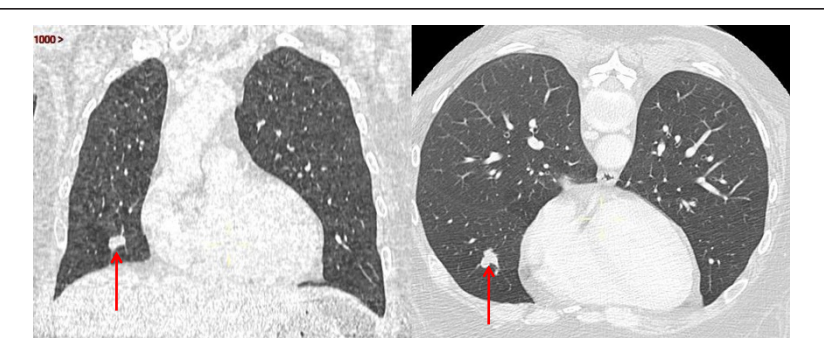
Figure 3 Frontal and axial chest computed tomography scans showing adenoid cystic carcinoma metastasis (red arrow) in the right middle lobe of the lung.

Hatiboglu et al. demonstrated that brain metastasis from an ACC of the Bartholin gland responded well to radiotherapy at a total dose of 30Gy but the follow-up interval was only one month [9]. We could not find the same efficacy, probably because of the presence of multiple lesions that could not be surgically removed. Indeed, a randomized controlled trial showed that patients with a single brain metastasis treated with surgery and radiotherapy had a longer survival and a lower recurrence rate than patients treated with radiotherapy alone [10]. However, in cases of multiple or inoperable brain metastases, whole brain radiotherapy is recommended [10]. In the present case, there were three lesions in the cerebral cortex making surgery difficult and risky. Thus radiotherapy as a primary treatment proved inadequate since it had no effect on the brain lesions and lung metastasis appeared.