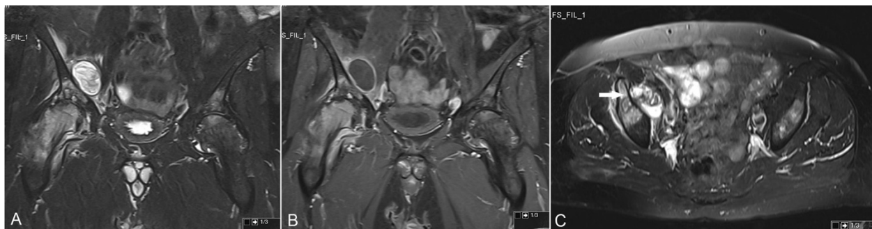
Figure 2 Coronal (A and B) and axial (C) magnetic resonance imaging scans. Coronal T2-weighted fat-saturated (A) and T1-weighted fat-saturated contrast-enhanced (B) magnetic resonance imaging scans showing a cystic lesion located on the medial side of the right iliac bone. The cyst is associated with the adjacent acetabulum (white arrow) on the axial fat-saturated magnetic resonance imaging scan (C).

Our patient had an uneventful post-operative course with no complications. Post-operative prophylaxis of intravenous antibiotics, consisting of a first-generation cephalosporin (cefazolin, 1g every eight hours) and an aminoglycoside (gentamycin 5mg/kg/day) were continued 48 hours after the surgery and low-molecular-weight heparin prophylaxis was administered for 10 days. Active and passive hip ROM exercises were started on the second day post-operatively with mobilizing on crutches, and he was discharged from hospital on the third post-operative day. Full weight bearing without support was