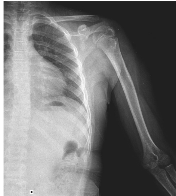
Figure 3 Radiologic image of shoulder after union achieved.