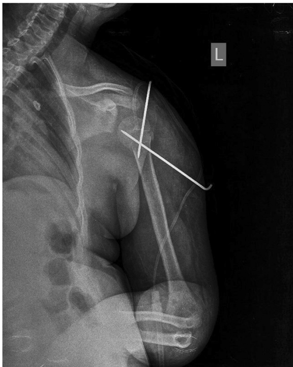
Figure 2 Radiologic image of shoulder postoperatively.

Shoulder dislocations are very rarely observed in children. Rowe reported that only eight out of 500 patients with glenohumeral joint dislocation were under the age of 10 [1]. Proximal humerus fractures without glenohumeral dislocation are more frequent among children. Shoulder