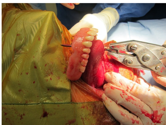
Figure 3 Removal of the nail from the mouth using surgical pliers. The nail was withdrawn through the hard palate, upper denture and tongue.

bypass in a patient with iatrogenically limited mouth opening are challenging. Our patient, who remained cooperative and haemodynamically stable, had a three-inch nail pinning his mouth shut, preventing conventional intubation via the orotracheal route. The potential for rapid haemodynamic deterioration due to the intrathoracic penetrating injury required urgent surgical exploration. The uncertainty in the location of the intrathoracic nails meant the exact nature of the surgical repair was not defined and provision for lung separation needed to be planned for. In this case, the chest X-ray failed to allow an adequate appreciation of the nail within the thorax. This occurred because the nail was imaged in short axis resulting in its appearance as a dot, which rendered it difficult to see. There was also a loss of the characteristic nail shape, which would have facilitated detection. A lateral chest X-ray would have been useful in this scenario but this, unfortunately, had not been ordered. Although transthoracic echocardiography suggested the nail had penetrated the right ventricle, the exact location of the nail was not visualized.