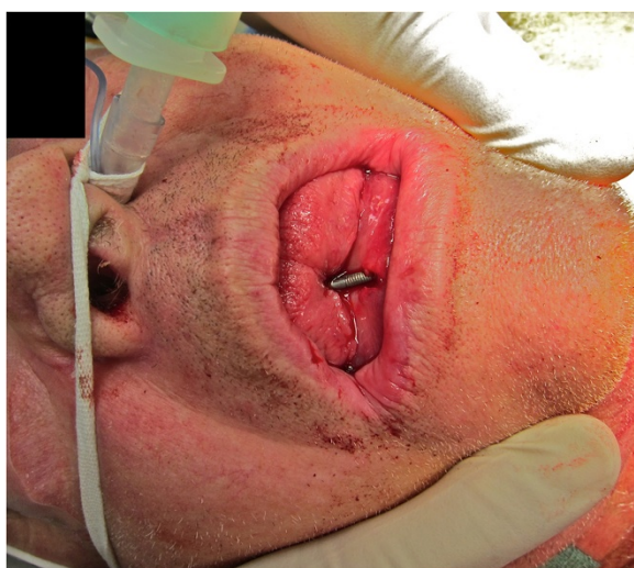
Figure 1 High-velocity nail gun injury that entered through the submental triangle penetrating through the floor of the mouth, tongue, dentures and hard palate, severely limiting mandibular excursion.

area under his chin, pinning his mouth closed. The nails within the thorax could not be confidently located on chest X-ray; however, transthoracic echocardiography suggested a nail had possibly penetrated into the right ventricle. There was no associated pericardial effusion. In light of the potential for rapid deterioration, the patient was immediately transferred to the operating theatre where preparations for an exploratory midline sternotomy and thoracotomy were made.