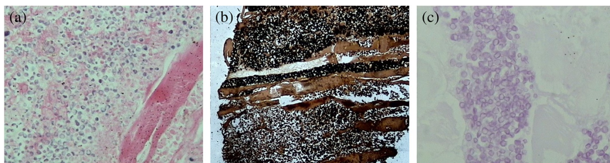
Figure 3 A histopathological analysis of muscle tissue showed focal necrosis with inflammatory cell infiltration and diffuse fungal spores among the muscle cells. (a) hematoxylin and eosin stain, \times 100 ; (b) Grocott's methenamine silver stain, \times 100 ; (c) periodic acid-Schiff stain, \times 400 .

Apart from the treatment of aspergilloma in fibro-cavitary lung disease with intra-cavitary amphotericin B [9-11] and Candida joint infection with intra-articular amphotericin B [12,13], the local administration of antifungal drugs for IFIs is uncommon. Itraconazole was registered for use in 1991 and is widely used to treat several forms of mycosis; however, to the best of our knowledge this is the first case report of the use of intra-lesional itraconazole for fungal myositis.