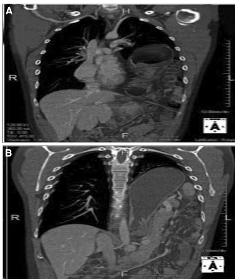
Figure 3 (A,B) Computed tomography scan of the chest. Coronal reconstruction. Part of the stomach, adjacent to the heart (A), is clearly visible. Some bowel loops (B) are also visible on left side of the chest: the left lung is displaced and compressed.

The CDH is a displacement of the abdominal organs into the thoracic cavity through a weak area or a distinct defect in the diaphragm. The causes of precipitating viscera herniation may be related to mechanical or pressure changes in the thoracoabdominal cavities. The most frequent types of diaphragmatic hernia are the left posterolateral (Bochdalek hernia) and the sternocostal (Morgagni hernia) types. A Bochdalek hernia, resulting from inadequate closure of the posterolateral pleuroperitoneal membrane, is the most frequently seen congenital diaphragmatic hernia. Defects occur more frequently on the left side than on the right side of the