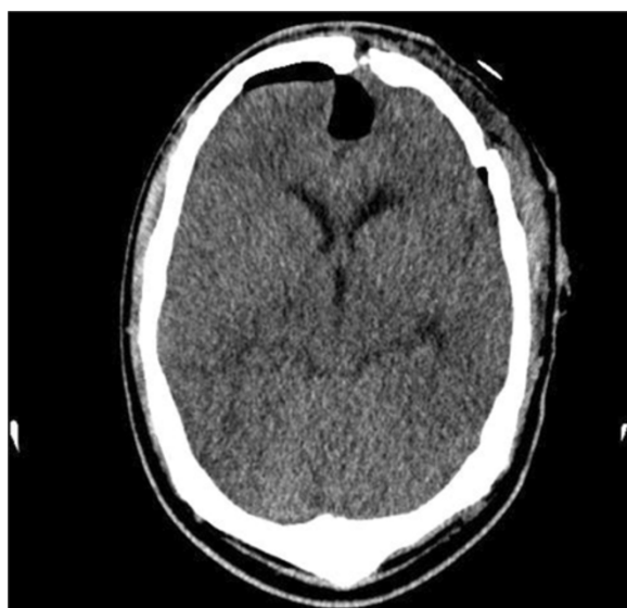
Figure 3 Post-operative computed tomography scan showing successful craniotomy.

Intracranial chondroma has also been reported as a component of Ollier's multiple chondromatosis [9]. Pontine hemorrhage has also been associated with parasellar intracranial chondromas [3]. Association of skull base chondromas has also been reported with Maffucci syndrome [10].