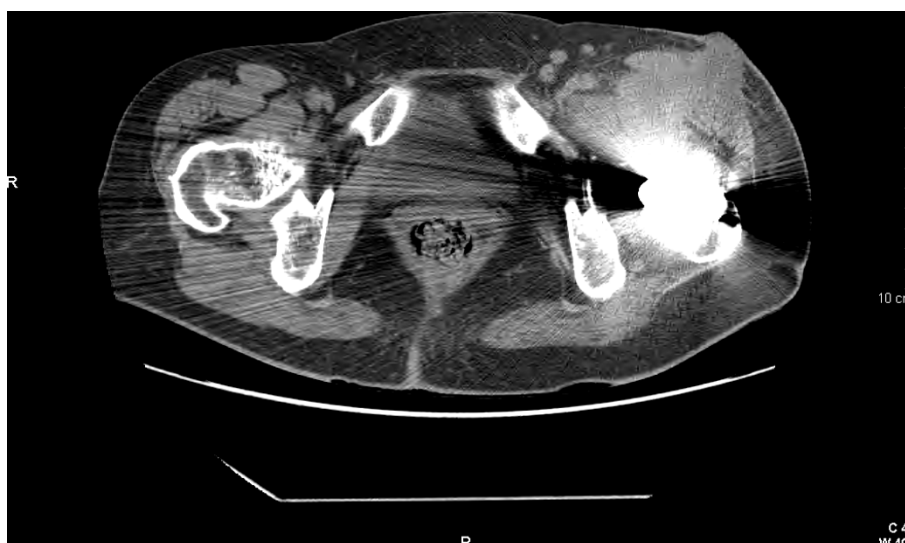
Figure 1 A computed tomography scan image of hip arthroplasty. Evidence of a periprosthetic abscess with diffusion to the left psoas muscle and cutaneous fistula is shown.

and appeared to be completely healed after six months. Our patient was totally asymptomatic and without pain upon hip movements after 15 months. The iliopsoas abscess was no longer evident on a CT scan performed about one year later.