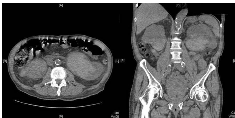
Figure 2 Computed tomography scan confirming ultrasound findings.

The treatment of high-pressure chronic urinary retention is decompression via a urinary catheter. Hematuria has been described following bladder drainage in 2% to 16% [2] of cases of urinary retention and generally is a self-limiting event. Gradual decompression of the bladder has not been shown to decrease the occurrence of hematuria, possibly because the damage to the bladder