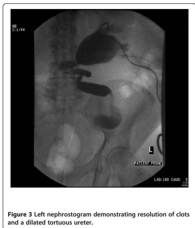
Figure 3 Left nephrostogram demonstrating resolution of clots and a dilated tortuous ureter.

wall precedes catheterization [3]. In the absence of randomized controlled trials, the literature supports quick and complete emptying of the obstructed bladder in all cases of retention [2]. Significant hematuria can occur in a number of cases after operative relief of ureteric obstruction but this can be attributed to the surgical trauma rather than to the effect of decompression on the urothelium. We described a case of significant bilateral upper urinary tract hematuria following drainage of high-pressure chronic retention. The only similar case reported in the literature [4] involved a 69-year-old man who developed frank hematuria and fatal uremia following bladder decompression. Cystoscopy revealed blood draining from both ureteric orifices, and a post-mortem examination showed bilaterally distended upper tracts filled with blood clots.